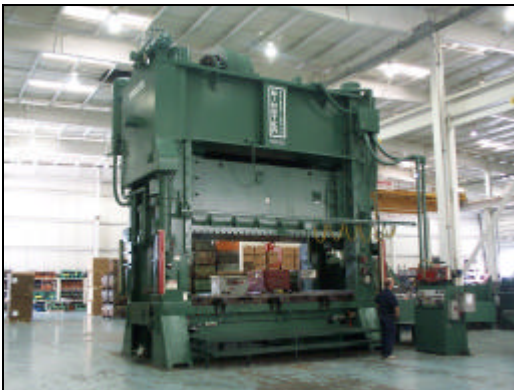
Grant 800 Ton Minster

AirLoc Wedgmound Precision Levelers are available in a wide range of sizes with load support from 100 to 220,000 pounds per mount, and freestanding, bolt-on, and bolt-through attachment capabilities. With a variety of pad types and thicknesses available, the Wedgmound series is suitable for all types and sizes of presses and machine tools.