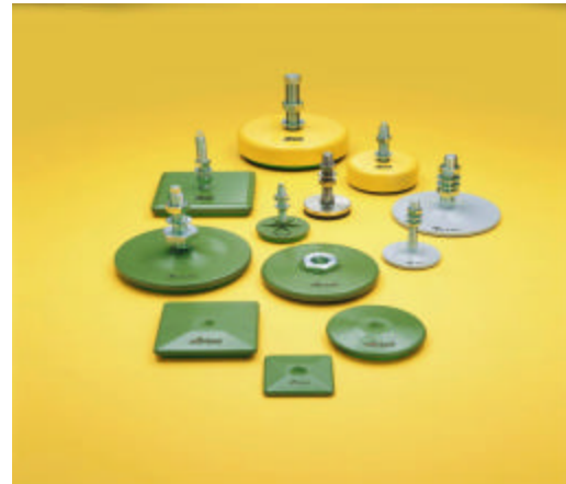
AirLoc Jacmounts with Pads

For more information regarding AirLoc Isolation/Damping Pads or Jacmounts contact our headquarters in Franklin, MA or your regional AirLoc Representative