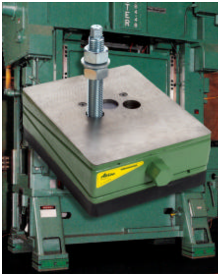
AirLoc ®Wedgmounds on Presses

The pictures below shows a few of the standard ®Wedgmound configurations and two typical press applications.