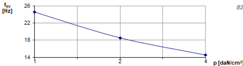
Diagram vertical natural frequency

Tolerance natural frequency vertical f 0v [Hz] 10% +/-