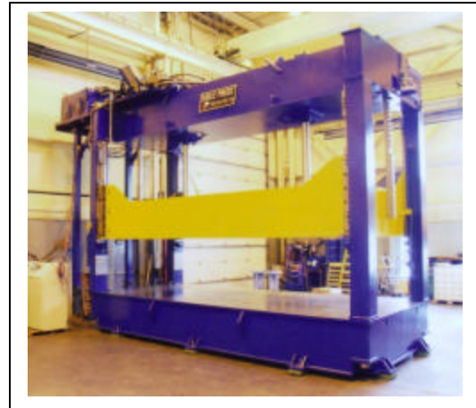
Custom Eagle Hydraulic Press

For more information regarding AirLoc Wedgmounds and/or Isolation Pads, contact our headquarters in Franklin, MA or your regional AirLoc Representative